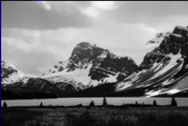
Bonnie Rilett Crowfoot Glacier BNP 1 st Place, SILVER 77.7 points