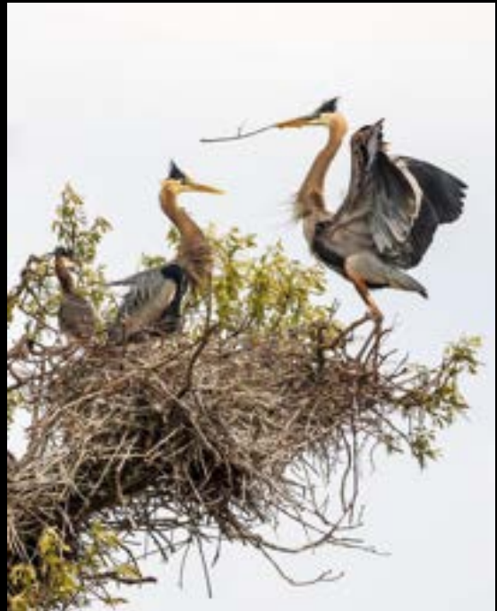
Bonnie Rilett Great Blue Herons KP 1 st place, SILVER 89.0 points