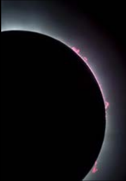
Doug Myers Total Eclipse of the Sun 1 st Place, GOLD 91.3 points