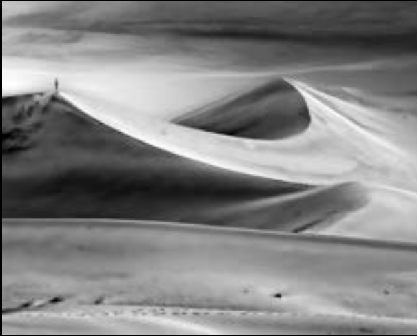
Willy VanAudenaerde At The Top 1 st Place, GOLD 90.3 points