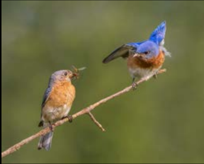
Alan Defoe Eastern Bluebird Couple 1 st Place, GOLD 92.3 points