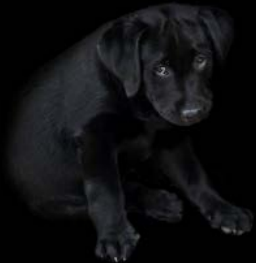
Brian Cowan Saddest Puppy-Dog Eyes 1 st place, BRONZE 86.7 points