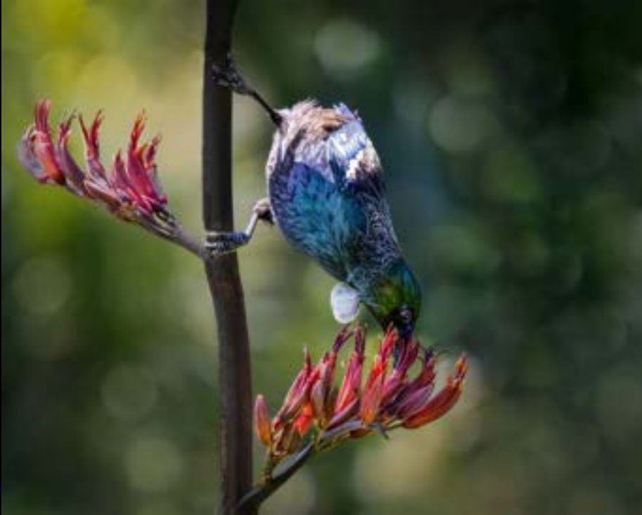
Linda Menard-Watt Tui Dining on a Flower 2 nd Place, SILVER 87.3 points