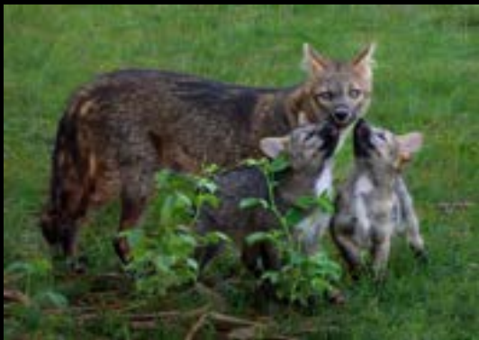
Linda Menard-Watt Crab-eating Fox with Kits 2nd Place, SILVER 87.3 points