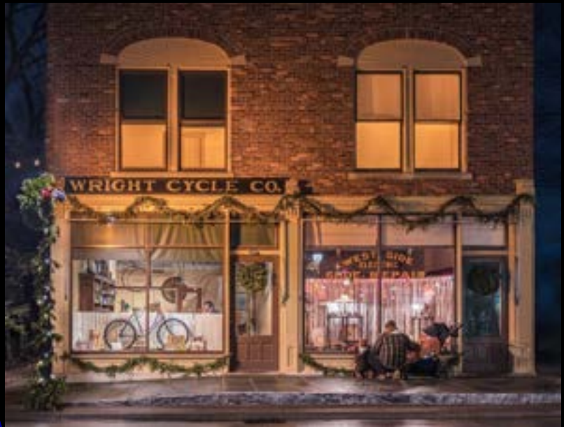
Margit Lanoue Looking in the Window 1 st place, SILVER 88.2 points