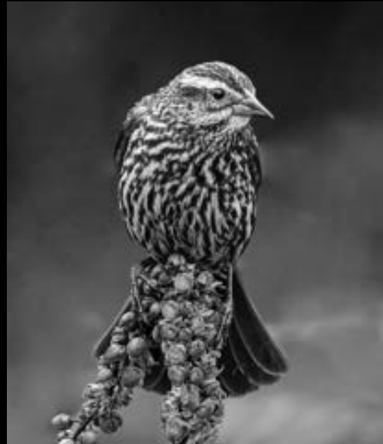
Linda Menard-Watt Female Red-winged Blackbird 1 st Place, SILVER 86.0 points