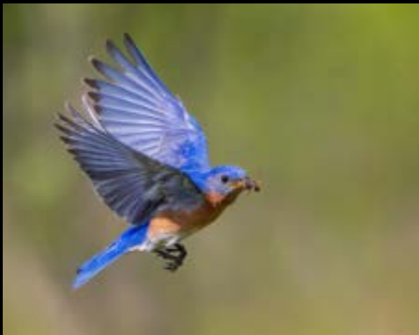
Alan Defoe Eastern Bluebird with Bug 1 st Place, GOLD 92.0 points