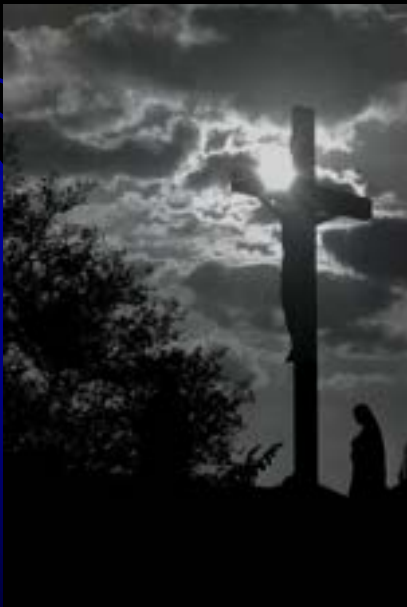
Brian Cowan Crucifixioin 1 st Place, BRONZE 77.0 points