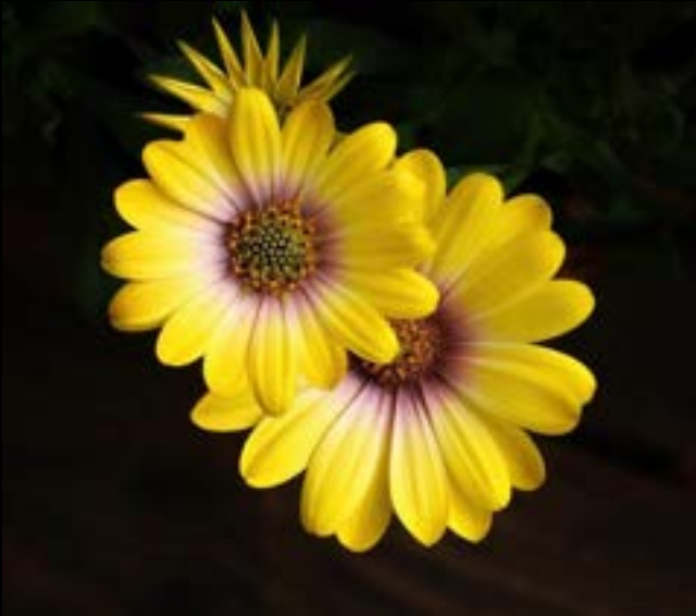
Ken Unis Yellow Daisies 1 st Place, BRONZE 86.7 points