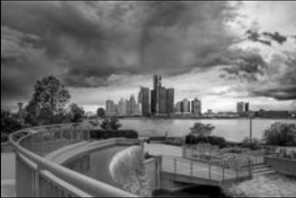
Doug Myers Stormy Skyline 1 st Place, GOLD 86.0 points