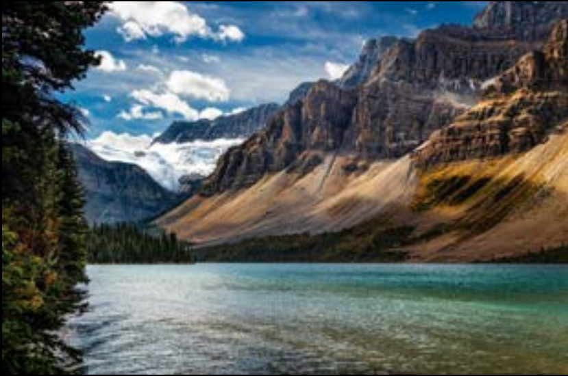
Alan Defoe Hidden Glacier 1 st Place, GOLD 90.0 points